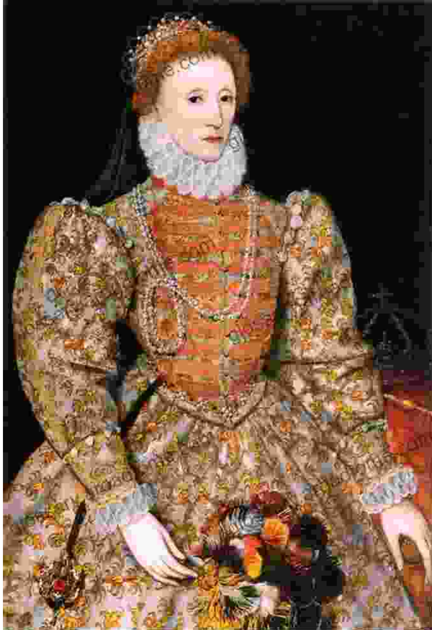
Elizabeth I, the Virgin Queen