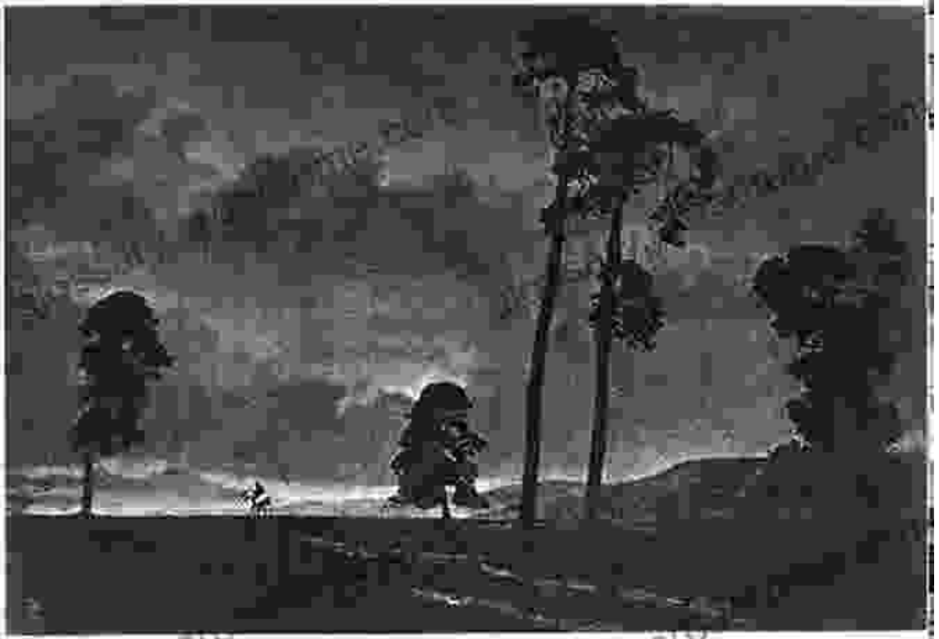
A lone horseman traverses the endless expanse of the Great Plains, embodying the spirit of exploration.